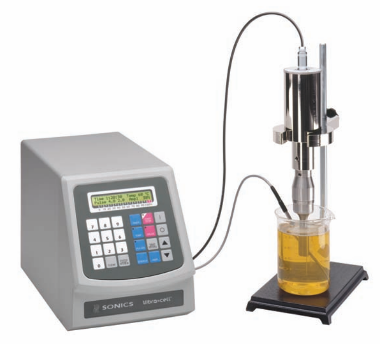
VCX 500 - VCX 750